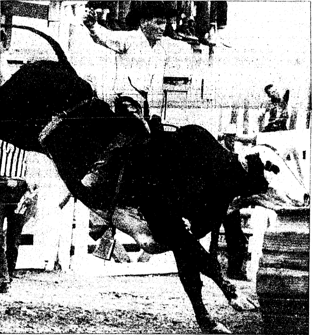
With a chorus girl kick this Brahma gives his cowboy a rough ride