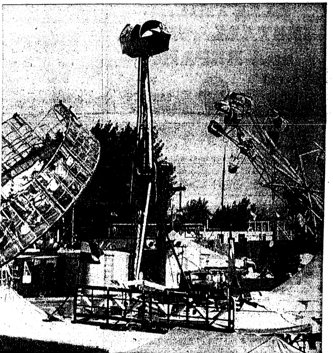
Three popular rides at the midway — Parachute, Roll-o-plane and Round-up