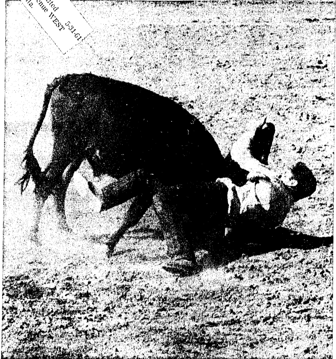
There were some fast times for dogging Friday and this one is going down too