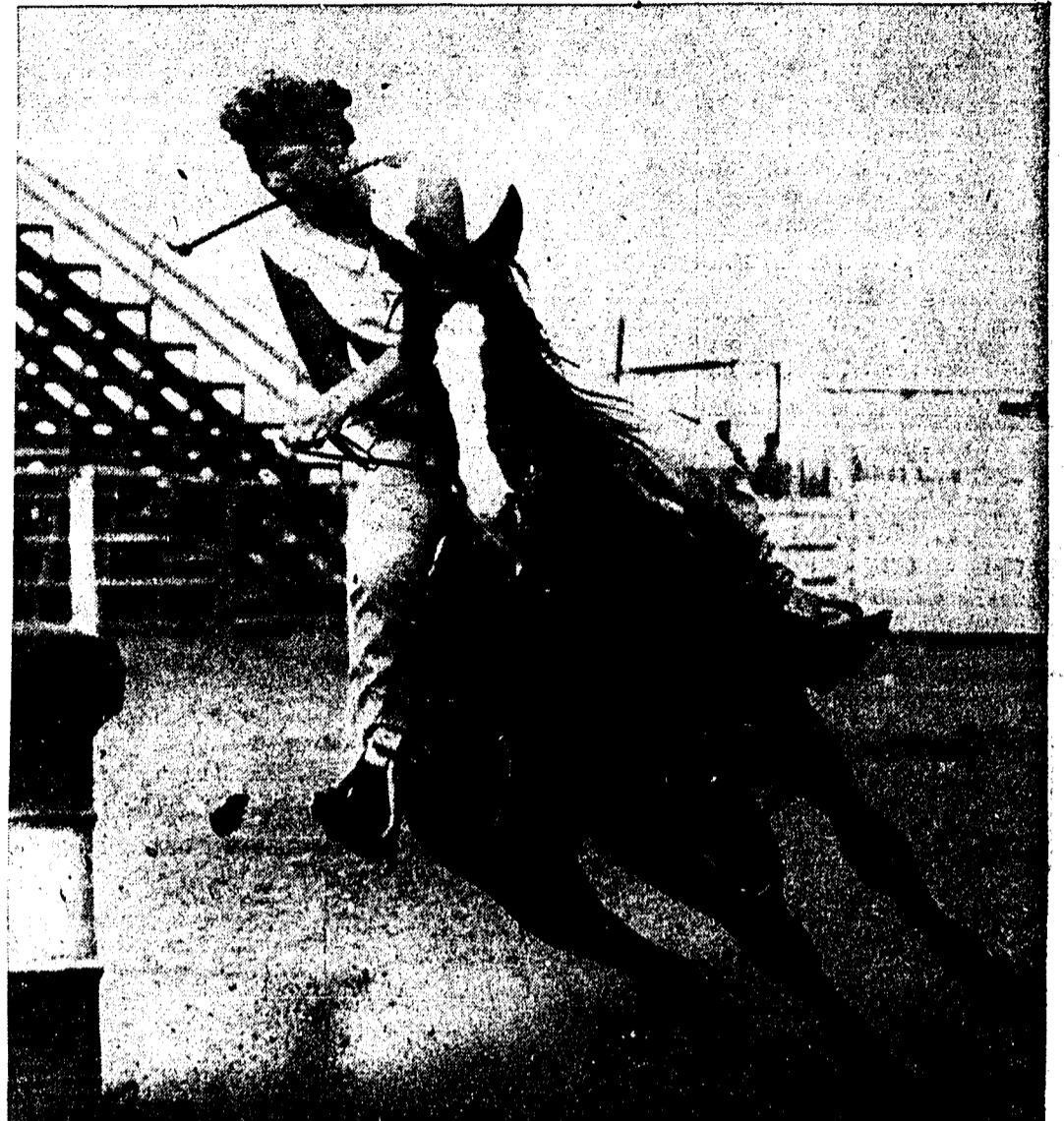
Whip in mouth, this rider is heading into the stretch of barrel race

OTTAWA (CP)—Prime Minister Diefenbaker announced today the federal government's winter works program will be continued during the coming winter with a major expansion in the types of projects qualifying for financial aid.